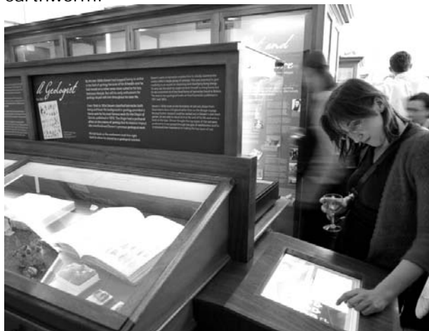
A visitor explores an interactive display at the opening event.

When Darwin returned home he became very active in the Geological Society of London and he used his geological collection to support his talks and articles about global-scale geological processes. These were followed by a trilogy of books on Coral Reefs (1842), Volcanic Islands (1844) and South America (1846) that made his early reputation as a scientist. Although his later work was mainly concerned with how animal and plant species evolved, geology featured prominently in Origin of Species and continued through his later life with his work on fossil barnacles and his final book on the action of the earthworm.