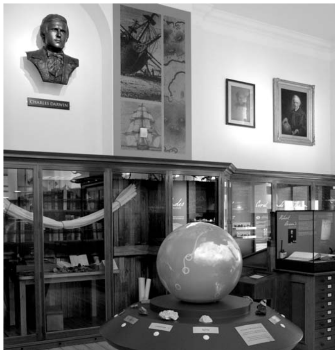
The globe depicting the Beagle voyage, with a reconstruction of Darwin's cabin in the background.

A ground-breaking new exhibition displaying the specimens that Charles Darwin collected during his early scientific career as a geologist.